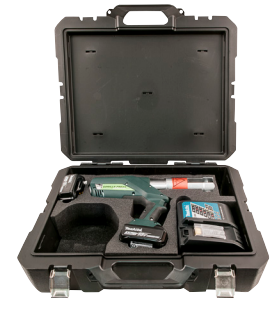
PSTLP-KIT002 Pistol Grip Tool. 2 Batteries & Charger