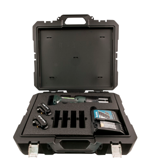
Inline Tool, 2 Batteries & Charger