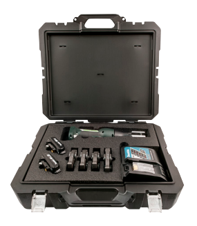
INLP-KIT001 Inline Tool, 4 Jaws. 2 Batteries & Charger