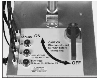
Indicator Lights & ON/OFF Switch

CAUTION: Do not use the LB-5 on corner grounded delta systems or on delta systems with grounded center tapped windings. For grounded delta systems use Load Box model LB-5-1.