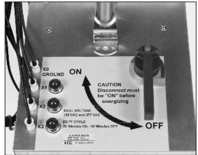
Indicator Lights & ON/OFF Switch